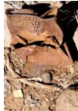
A crushed coffee pot found on historic Ehrenberg Road.