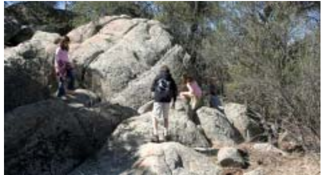
Children enjoying Nature Center on opening day.

Now let’s consider actual progress in acquiring critical areas, speaking only of the expenditure of dedicated funds. All of these actions involved the active participation of OSAAC. Admittedly progress has been at a snail’s pace, but for reasons I will outline. In September, 2005, the City of Prescott purchased a conservation easement on 28.6 acres of land within the Granite Creek riparian corridor for $187,500.