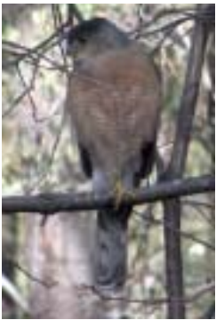
A hawk looks for lunch in Groom Creek.

“..open space that protects the best of our natural resources on behalf of ours and future generations of Prescott’s citizens.”