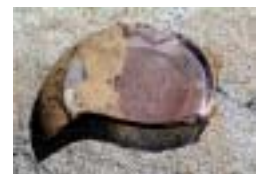
A piece of 19th century history: a broken glass bowl found near Ehrenberg Road.