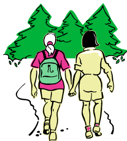
Prescott Outings Club members prepare for the semi-annual Thumb Butte Trail clean-up on October 25.