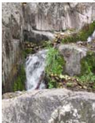
The gentle beauty of Grapevine Springs on a day in November.

Within the upper reach of the canyon there is a cluster of springs that seep from the north-facing slope and feed a lush riparian forest gallery. With