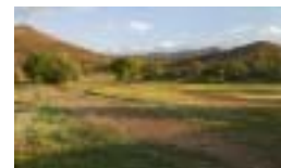
Storm Ranch section of the Prescott Circle Trail.