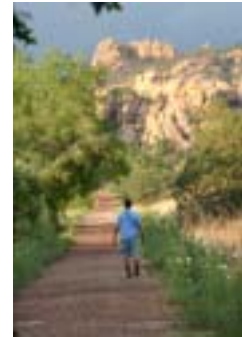
Peavine portion of the Prescott Circle Trail.

For more information on any of the preceding topics, or to volunteer for trail work, you can reach me at: rhehlen@fs.fed.us or (928) 443-8072.