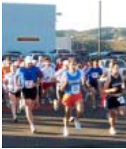
..and they're off at the Rails to Trails Run (above) while participants stretch near the YTA table (below).