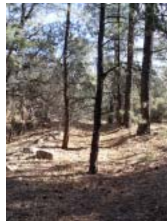
Swale and windrows, evidence of freight wagons of the past.

In 1863, the Homestead Act became law, allowing citizens to claim a free quarter-section of land (a section of land is one square mile, so a quarter is 160 acres). As a result, the government began surveying Arizona in