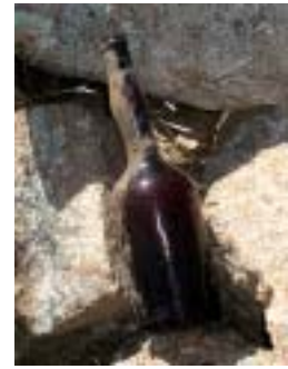
A rare find: an unbroken bottle undisturbed for more than a century.

In the next issue, I will write about the two trails: the Ehrenberg Road and the Hardyville Road. Arizona State Parks has a map and description of these two trails and many others. Copies of this brochure, titled "Historic Trails of Arizona," can usually be obtained from Sharlot Hall Museum.