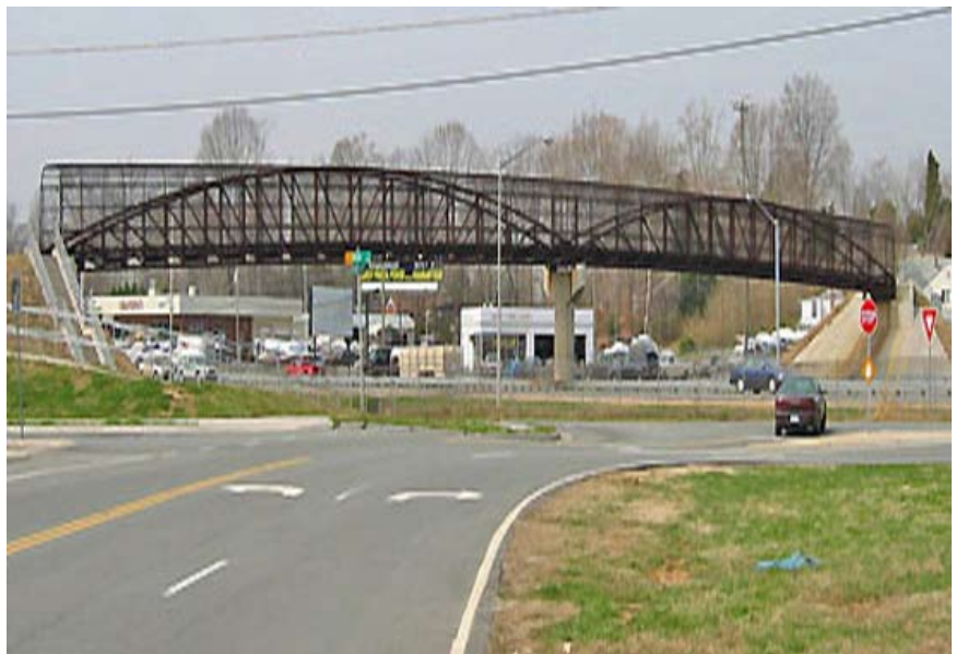
Grade seorated pedestrian bridge

The engineering and actual installation and related trail and street construction tasks could be performed with a variety of local resources such as City Public Works, AP&S, Civiltect,