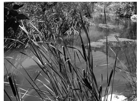
Section of upper Verde River