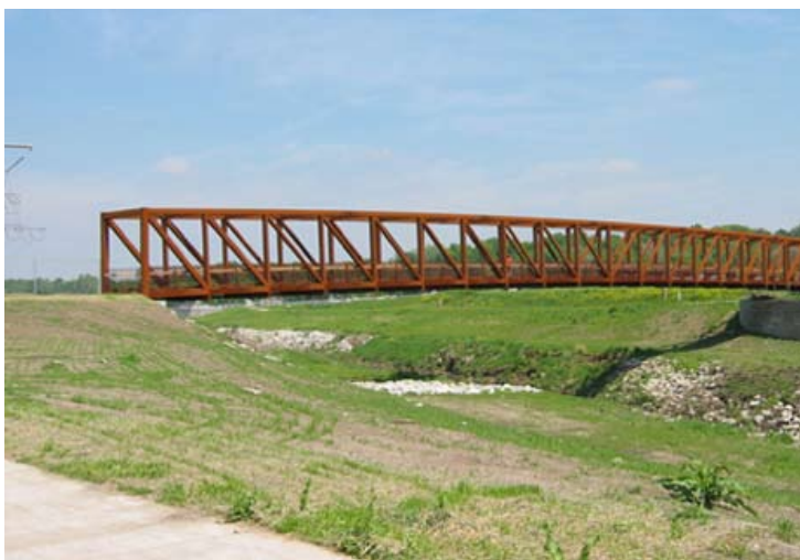
Steel truss pedestrian bridge over terrain feature

The funding and justification for a separated grade crossing is a project within itself. Ideally a Master Plan exists for an area or unique asset such as the Peavine Trail. A developer would be presented with the plans, easements, statutes, history of related grants, trail status, etc. at the early stages of the planning process. The increased values of property along a unique asset such as the Peavine should offset a majority of the added costs associated with the separated grade crossing. Besides the trail becoming an alternative transportation route for the new businesses and residents of the area, it is a gateway for recreation to the Granite Dells and Watson Lake areas. Shared funding approaches and the possible use of TEA grants can minimize the burden to a single entity related to the added costs for the crossing. Good planning can make the justification for separated grade crossings an 'automatic'.