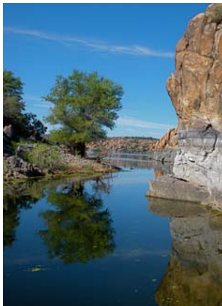
Secret Cove, on spur trail

At each junction, there are great maps on signposts, so you won't get lost (you can also see a map on the City website). Chris is not only inventive when it comes to trail routes, his signs are made from aluminium cut from old Stop signs, so they are sturdy and inexpensive – yes, “aluminium” is spelled that way where Chris and I come from!